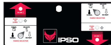
Stack Dryer Control